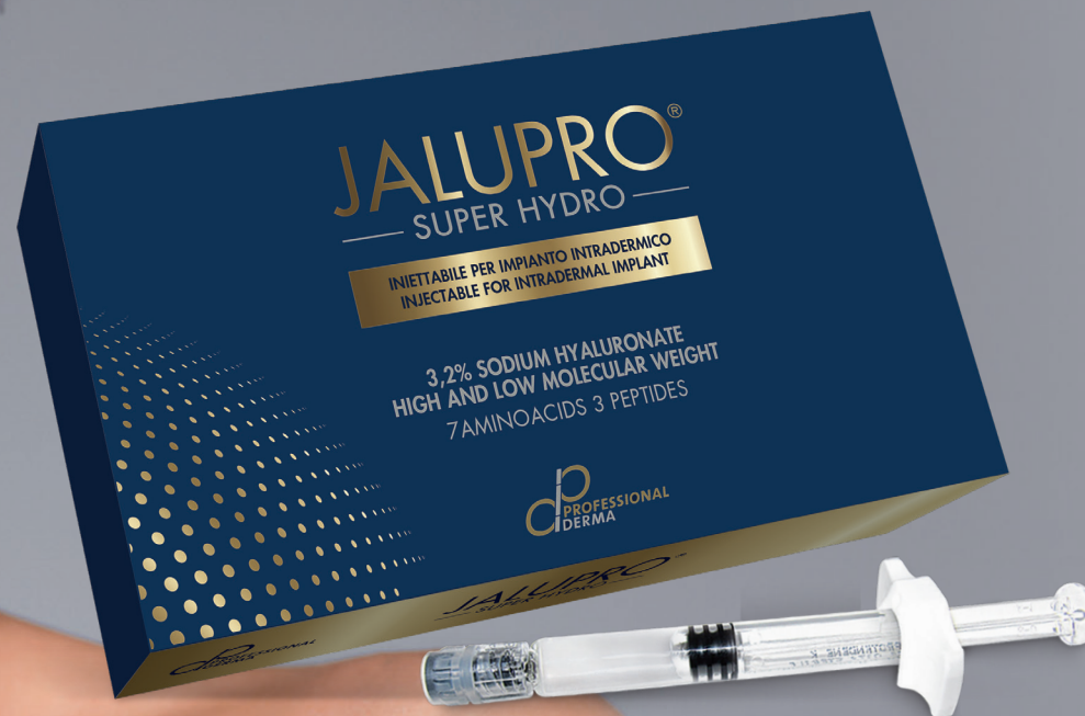
2,5 ml prefilled syringe